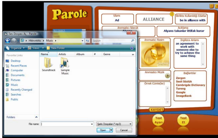
Fig. 2. Screenshot of adding sound/music to a studied word.

The box for the visuals could be used either for a random visual that the students thought reminded them of the target word or they could use it to strengthen the relationship between the target word and keyword by pasting there a visual related to the keyword. The students were directed online to websites where they could get free visuals related to their search or they could go into their own files for visuals. Students could also add a piece of music that would remind them of the target word to each target word separately and save it for further use. They could only use music in their own files and downloading music was not allowed due to copyright issues. The music could be played in the background or stopped with a button while the student was working with a target word. Figure 2 shows a screenshot taken when a student was adding music to the study board.