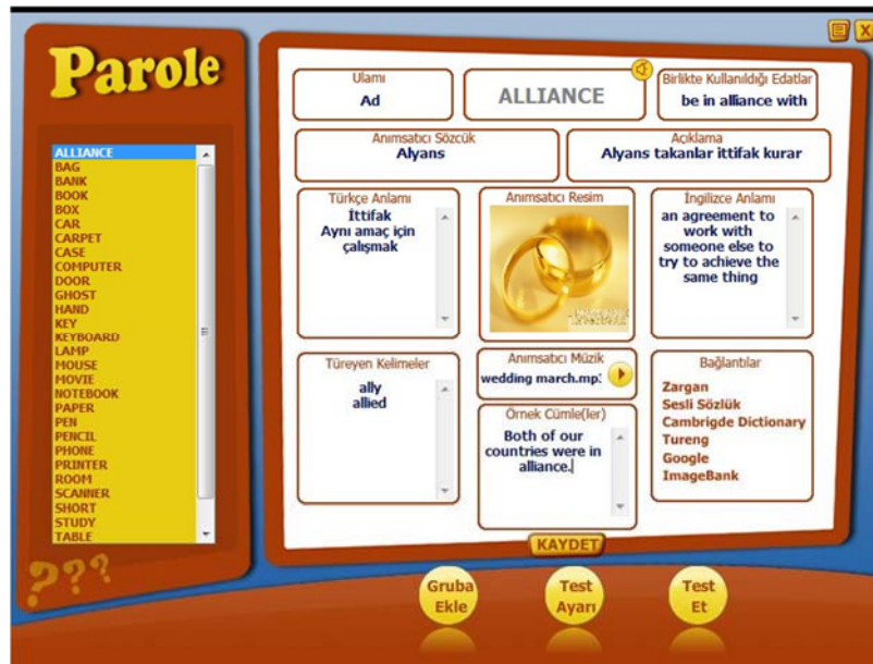
Fig. 3. Screenshot of fully completed board for the word 'alliance'.